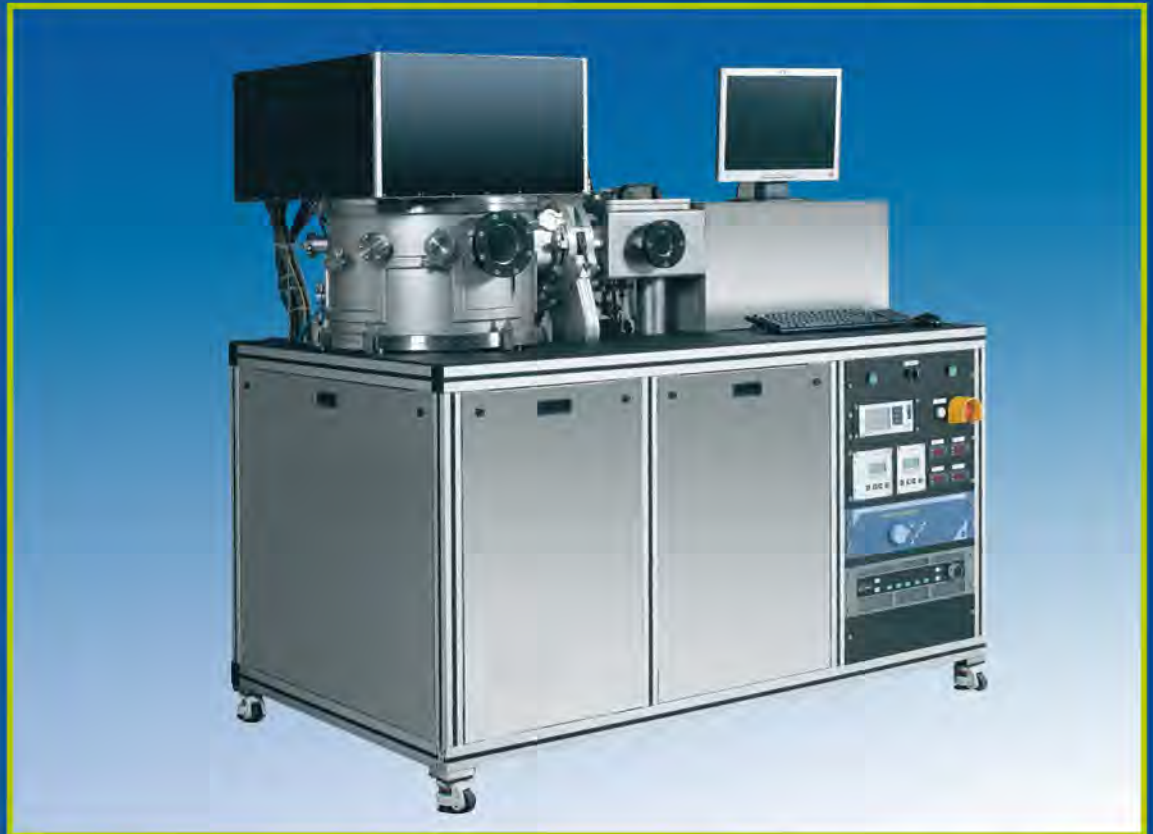
“Horizontal sputtering model KS 500 H”

Kenosistec horizontal sputtering systems are designed and realized to provide excellent UNIFORMITY, flexibility and easy handling of substrates. These features make them the ideal tools for R&D ACTIVITIES and process development. A full range of options is available to optimize their performances for special applications.