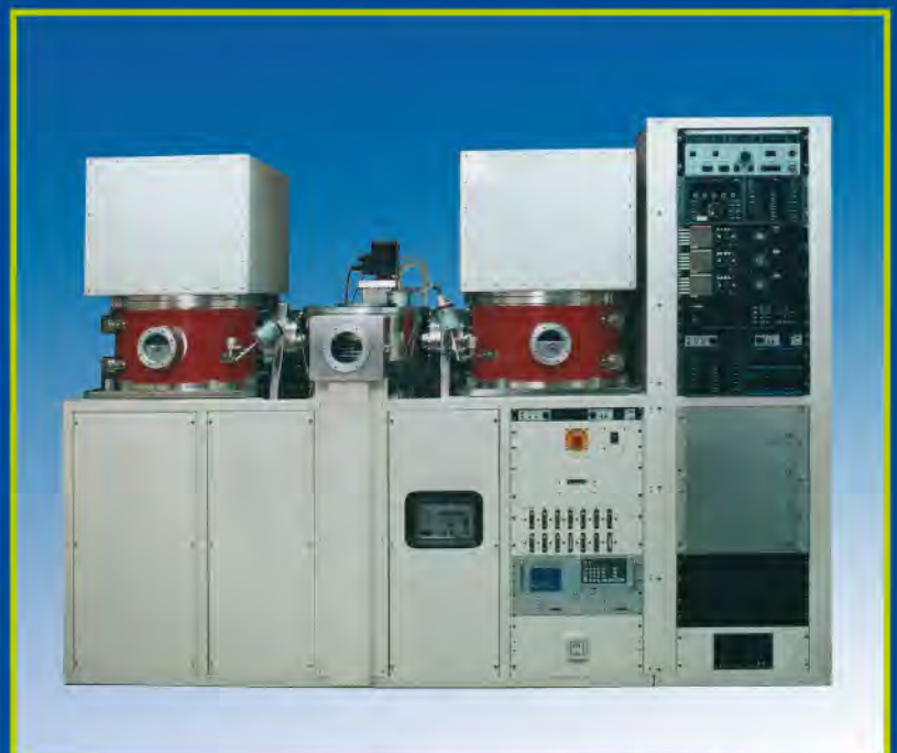
“Horizontal sputtering model KS 500 H Dual Chamber”

The KS 500 H “dual chamber” eliminates any source of cross contamination, allowing the realization of the most sophisticated processes. Chambers can be used either simultaneously or separately, in order to deposit complex multilayer structures. The sequence of the deposition can be varied over a wide range of parameters with a highly effective separation of DC and RF sources.